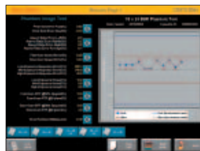
A graph on the first results page shows the most recent test results and passing ranges at a glance.